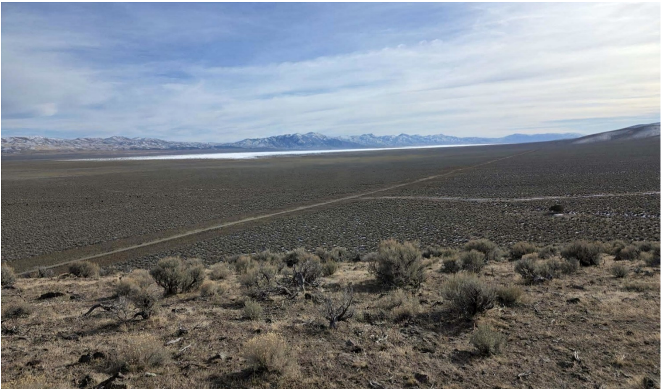
Figure 2: Location of the Fivemile claims in Fivemile Flats (looking southeast)

The presence of the Fivemile gravity high suggests a shallow dense rock body, possibly a rhyolite dome or a bedrock high, which could be Lower Plate carbonate rocks, the main host for Carlin-type gold deposits in the Cortez district. A magnetic low anomaly in this setting, commonly indicates hydrothermal destruction of magnetite in igneous rocks. Coincident magnetic lows and gravity highs are the hallmark of concealed yet shallow epithermal gold-silver deposits, and, in this location, such volcanic-associated mineralization may have overprinted an earlier Carlin-type gold deposit.